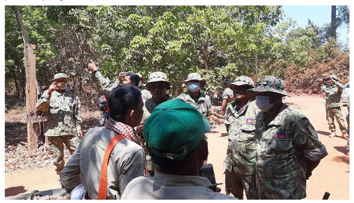
Ministry of Environment rangers in Kampong Thom province prevent members of PLCN from entering the protected area to conduct an annual tree-blessing ceremony, 25 February 2020

person to person and uses traditional musical equipment such as string bow, large barrel drums, and performed by village elders, parents and attendees."<sup>77</sup>